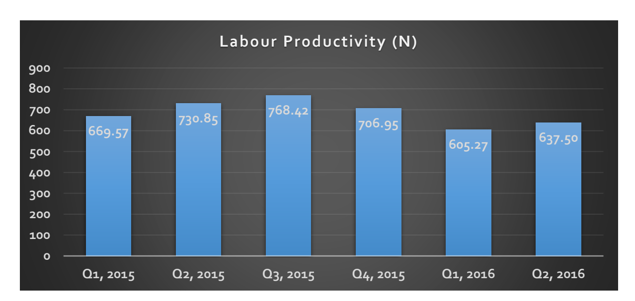
Figure 2: Labour Productivity (Q1, 2015 – Q2, 2016)

In Q2 2016 there were a number of challenges that may have impacted on labour productivity, some of which spilled over from the previous quarter, Q1 2016. For parts of the quarter, the petrol scarcity from Q1 lingered on, coupled with the hike in petrol and diesel prices. Investment in the economy was low, though some government investments were recorded during the quarter, the volume of private investment and foreign direct investments was still considerably low compared to previous years. Though there was some improvement in power towards the tail end of the quarter, which partly accounted for the slight improvement in Labour productivity, there was still significant power issues during the reference quarter, which affected production especially in the industrial sector. In addition, the scarcity of foreign exchange caused a large disparity between the parallel and official exchange rates, which made imported goods more expensive and affected the ability of businesses reliant on raw material imports for their production. As a result of all the above factors, firms had to retrench workers, resulting in the unemployment rate rising by 12.2% over the previous quarter and slowed productivity as recorded by GDP.